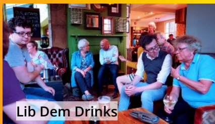
Lib Dem Drinks

Lib Dem Drinks 7:30pm onwards The Drummond, Woodbridge Road, GU1 4RF