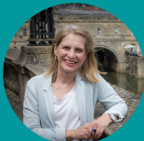
Wera Hobhouse MP