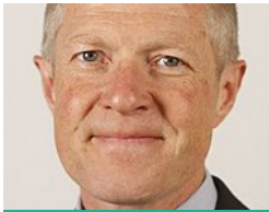
Willie Rennie MSP, former leader of Scottish Liberal Democrats