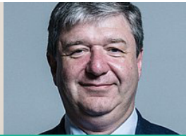
Alistair Carmichael MP, Liberal Democrat spokesperson for Home Affairs, Political & Constitutional Reform