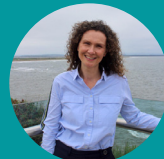
Wendy Chamberlain MP