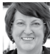
Catherine Bearder MEP