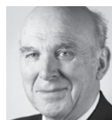
Vince Cable MP, Party Leader