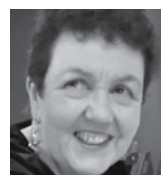
Sheila Ritchie, Scottish Party Convenor