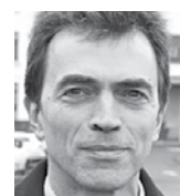
Tom Brake MP