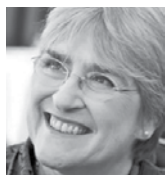
Baroness Sal Brinton, Chair, Party President