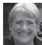
Baroness Sal Brinton