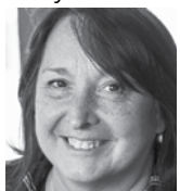
Christine Jardine MP, MP Rep