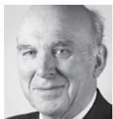
Vince Cable MP, Chair