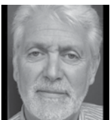
Lord Strasburger, Peer Rep