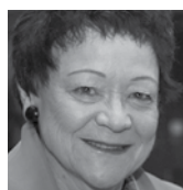
Sarah Ludford, Vice Chair