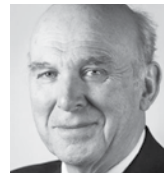
Vince Cable MP, Party Leader