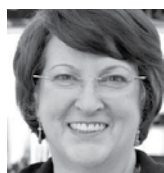
Catherine Bearder MEP