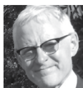
Norman Lamb MP