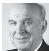
Vince Cable MP, Chair