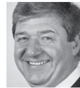
Alistair Carmichael MP, MP Rep