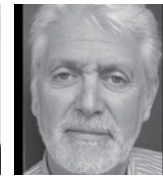
Lord Strasburger, Peer Rep