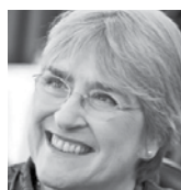
Baroness Sal Brinton