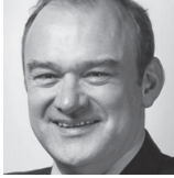
Ed Davey MP, Leader