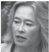
Baroness Julie Smith