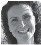
Wendy Chamberlain MP