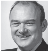
Ed Davey MP, Chair