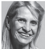
Wera Hobhouse MP