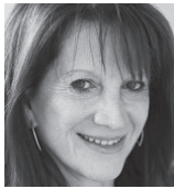
Baroness Lynne Featherstone