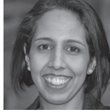
Munira Wilson MP, Parliamentary Group rep